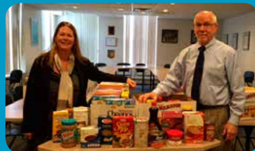
Southwoods Middle School in Syosset, NY, hosted a holiday food drive to help MercyFirst families. (above)