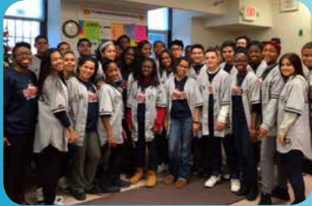
Jeter's Leaders spent the afternoon at MercyFirst's Angel Guardian Campus with activities and gifts for children, teens and families. (above)