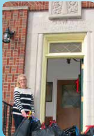
CYO Hickville collected toys and gifts for children of all ages. (left)