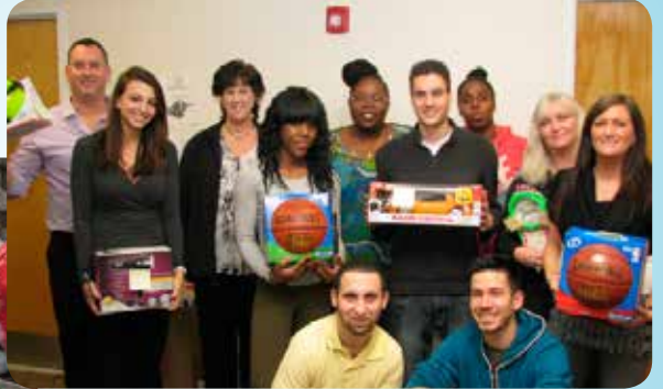
GEICO's Annual Holiday Toy Drive collected gifts for over 150 kids. (left and above)