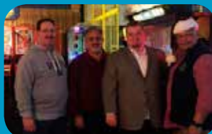
Local 342 UFCW hosted a holiday dinner for over 40 MercyFirst Foster families. (left)