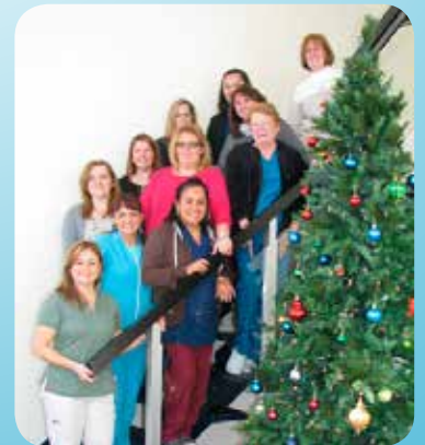
Our friends at Davis Vision collected toys for many of our teen youth. (right)