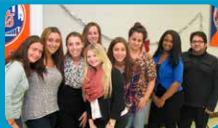
Molloy College Social Work Students (above) hosted a holiday party for our older youth.