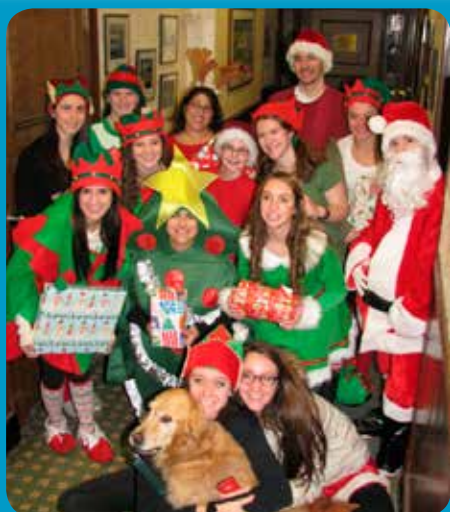
Seaford High School delivered tons of holiday toys. (above)