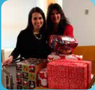
Staff at Northwell Health Ambulatory Services organized another wonderful donation this season. They sponsored 9 MercyFirst families; getting gifts for everyone in the family! (left)