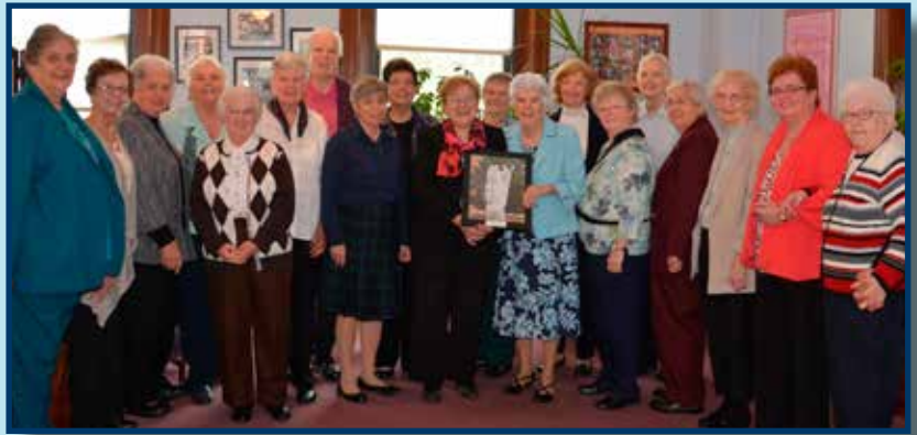
Many Sisters of Mercy have worked at Angel Guardian Home over the years and were in attendance at the farewell event.