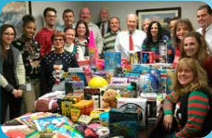
Our friends at Merrill Lynch sponsored a toy drive for youth of all ages! (above)