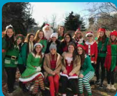
An amazing holiday breakfast was hosted by Freedom Fellowship of Christ and gifts were given by the Village School PTA. (below)