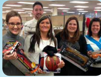
The Triumphant Church of God hosted a Toy Drive for our Brooklyn location. (above)