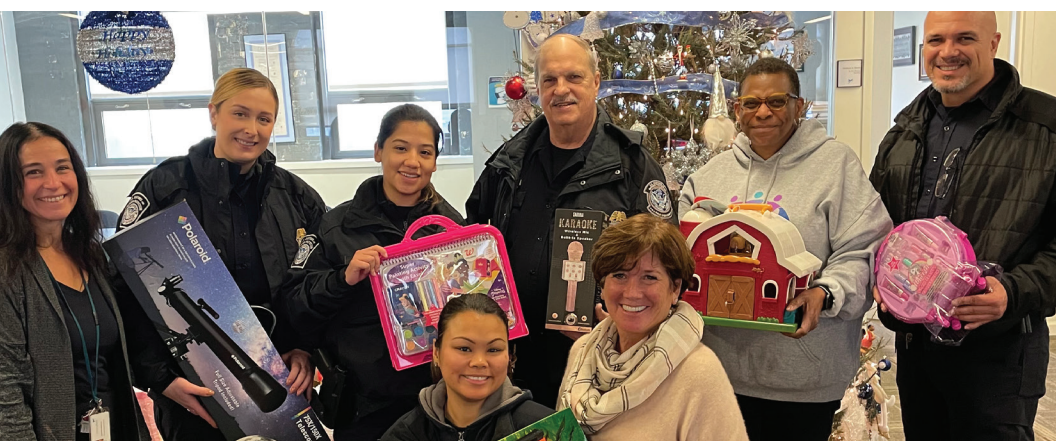
Friends from the U.S. Customs and Border Protection delivered gifts for our families during the holidays.

An additional 244 donations were made by generous supporters.