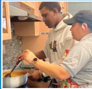
Foster care youth participate in a variety of cooking activities with our program staff.