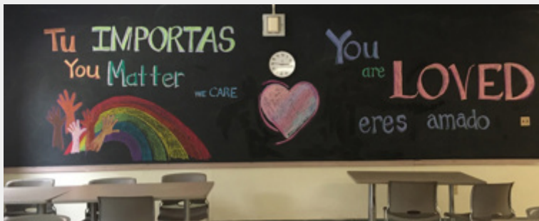
Chalkboard Mural from our Art and Creative Therapies Department