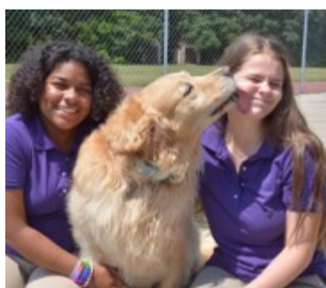
Mack always gave kisses to the youth.

This month we remember fondly two MercyFirst therapy dogs – Ben and Mack – who dutifully served our youth for nearly 20 years combined. Ben , not your traditional therapy dog, was a little grumpy and you had to earn his trust, but he was the dog our youth related to the most and found a niche providing comfort and healing to the kids who connected with him. Ben will always hold the honor of being the first rescue dog to join MercyFirst's Project C.A.R.E. (Canine Academy for Rehabilitation and Education), exemplifying the mutually beneficial relationship between shelter dogs and our youth, where each can help the other heal.